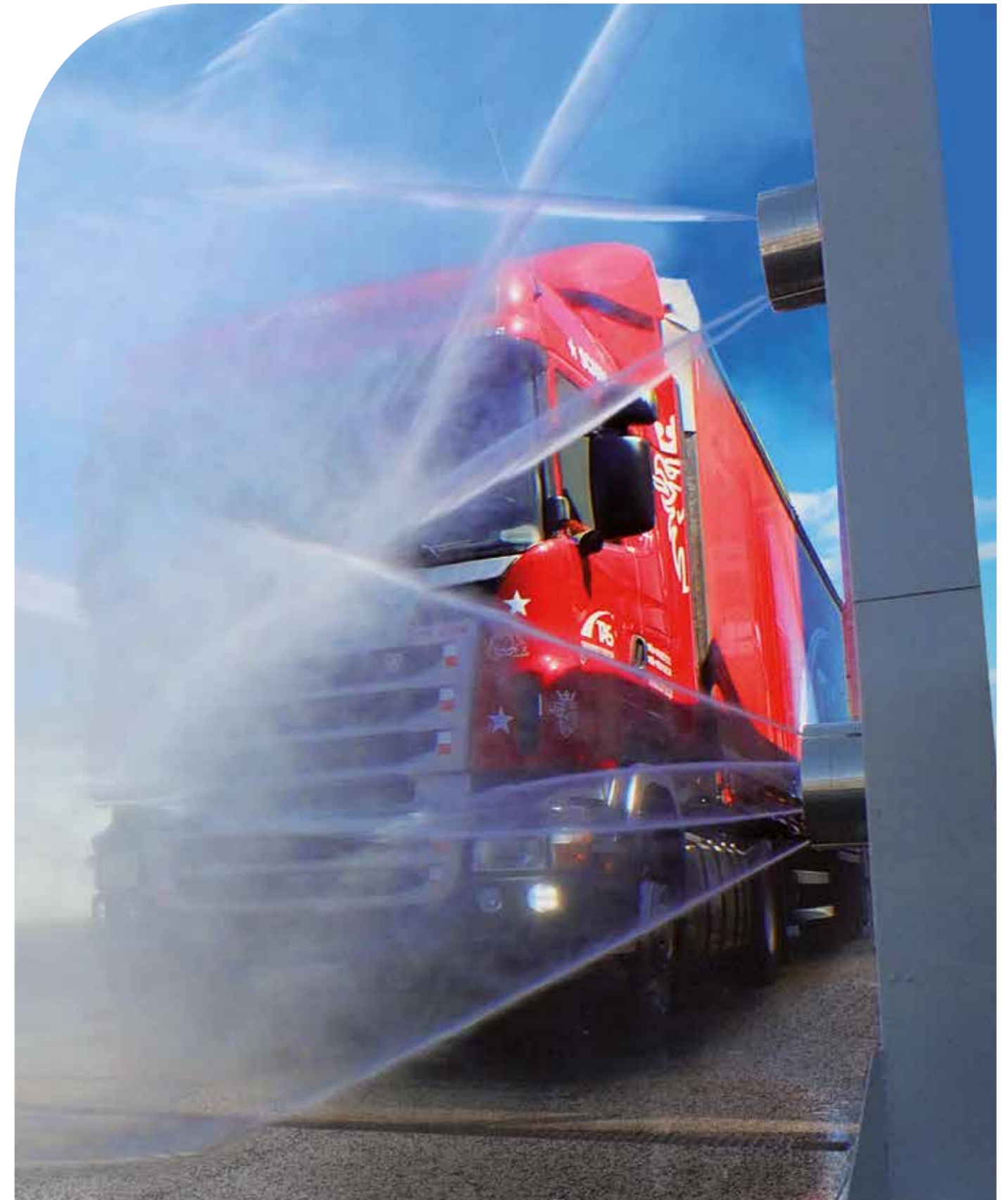
ISTOBAL HW'ROTATORS The only motorised system in the market